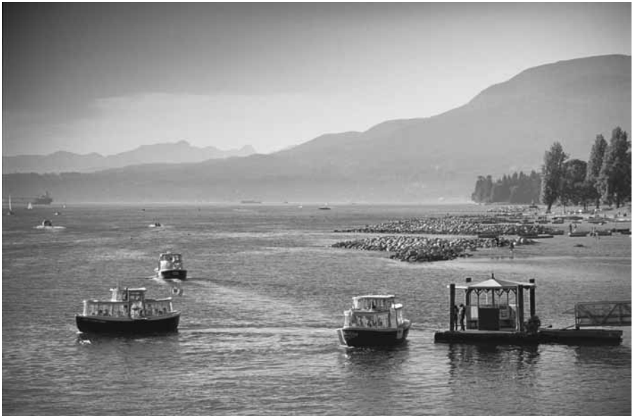
Tourism Vancouver-John Sinal